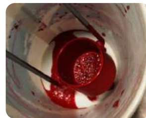
Micro Bubbles seen in the ink which can cause print issues