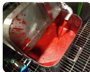
The ink is being "dropped" - into bucket adds air to the ink system

For more information on DuPont™ Cyrel® or other DuPont products, please visit cyrel.com