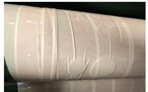
Wrapped Too Tight

For more information on DuPont™ Cyrel® or other DuPont Image Solutions, please contact your local representative.