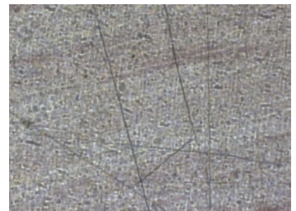
Solvent Plate Cracking

For more information on DuPont™ Cyrel® or other DuPont Image Solutions, please contact your local representative.